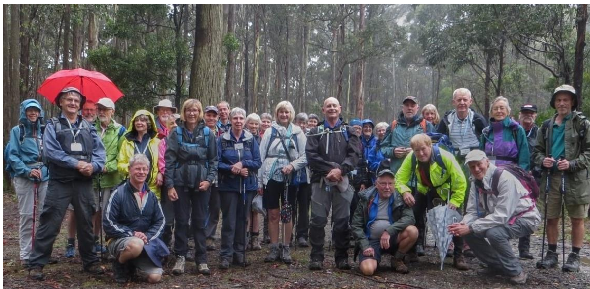
COVID uncovered hidden talents amongst the U3A Ballarat Hikers