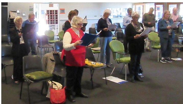
The U3A choir in Perth have started up again (using social distancing, of course)

Now there are glimmers of light on the horizon and activities are resuming. In many cases there are still restrictions on numbers but at least we seem to be heading in the right direction.